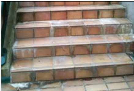
Before: cracked, frost damaged and stained tiles