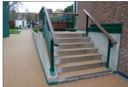
After: steps with stainless steel risers, in-filled with resin-bound paving, which will not tarnish or corrode over time