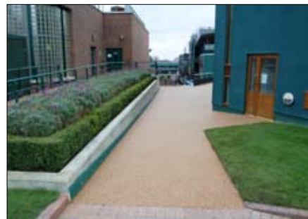
After: smooth, safe permeable resin-bound paving