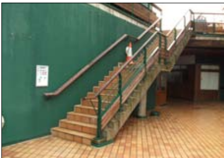
Before: cracked, frost damaged and stained tiles