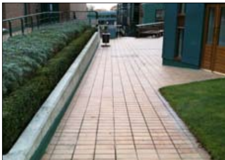
Before: outmoded and slippery tiles after rain