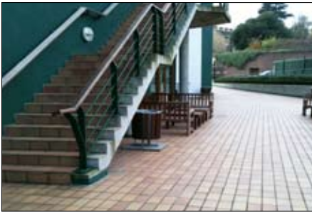
Before: the terrace flexed due to heat expansion and contraction, causing the tiles to lift.

The quality of the finish is superb, making it highly suitable for historic, heritage and prestige environments.