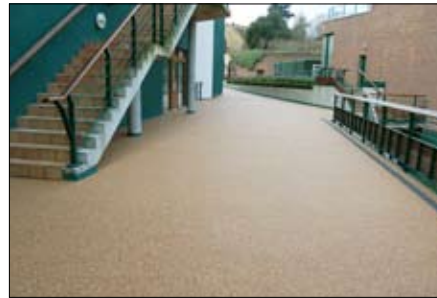
After: seamless flex tolerant resin-bound paving