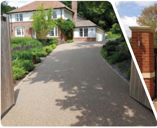
Private driveway, Kent