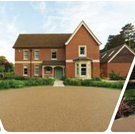
Private driveway, Bali award winning garden