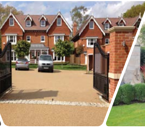
Carpark for new build development, Esher