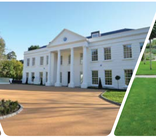
Private Driveway, London