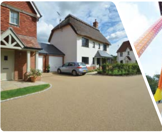
Berkeley Homes, The Ashmiles, Barns Green, Sussex