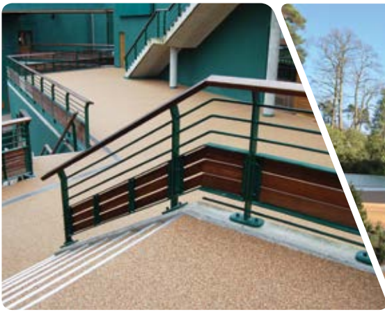
Terrace and stairs Wimbledon Tennis Club, Wimbledon