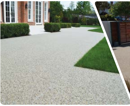
Private Terrace and Paths, Wentworth