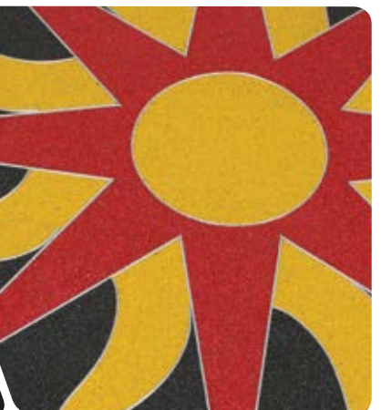
Prismstone Star Burst