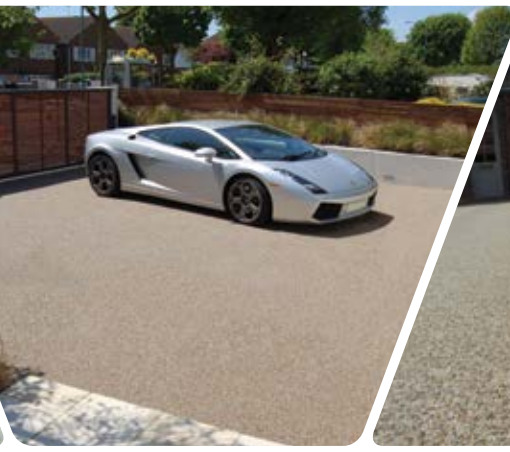
Private Driveway, Hove