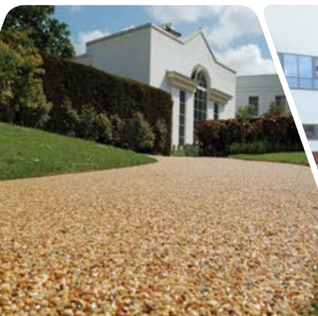
Pathways Royal Ballet school, Richmond Park, London