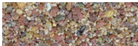
Clearstone: Spice Barley