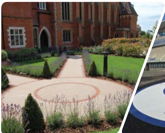
All Saints conversion for Berkeley Homes, Eastbourne

For more information about our Colour Ranges visit clearstonepaving.co.uk