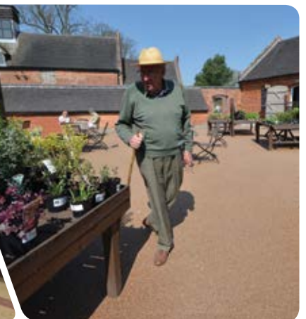
Courtyard National Trust's Baddesley Clinton