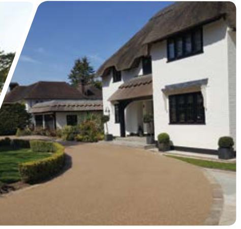
Private driveway, period thatch cottage, Kent