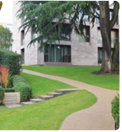
Pathways private estate, London