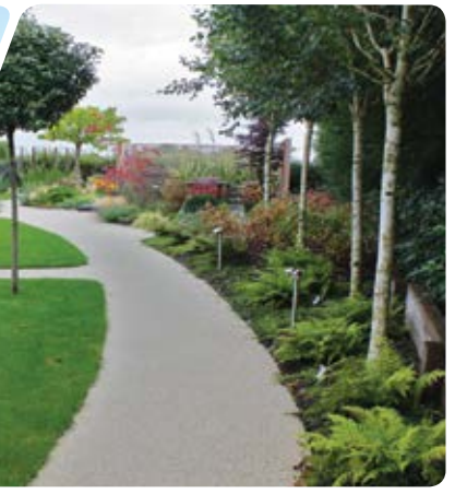
Garden pathways private home