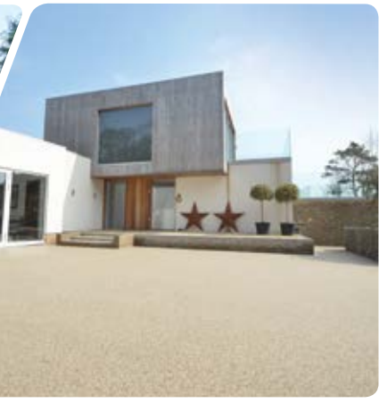
Private driveway, contemporary home