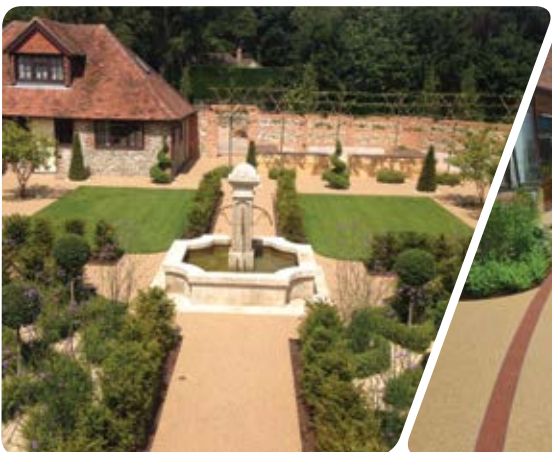
Resin bound pathways, Elizabethan Style Garden