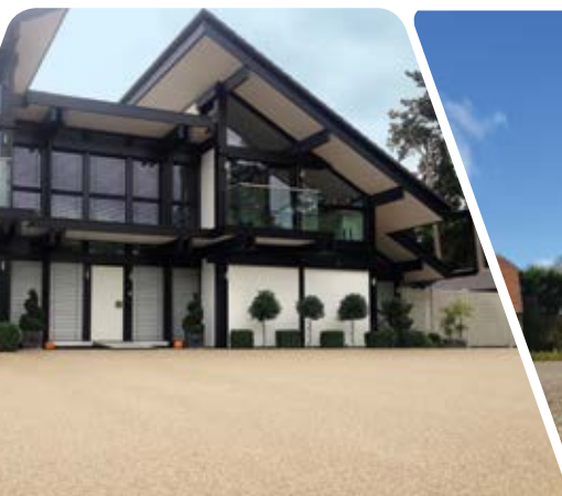
Private driveway, Huff House, Surrey