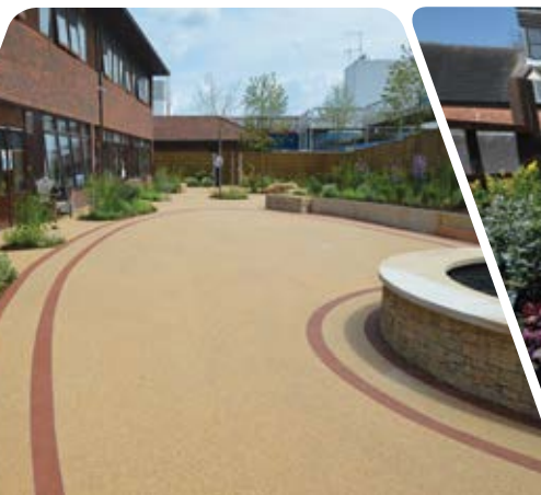
Horatio's Garden, Stoke Mandeville Hospital