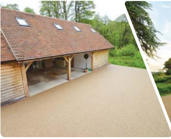
Private driveway, barn conversion, Hampshire