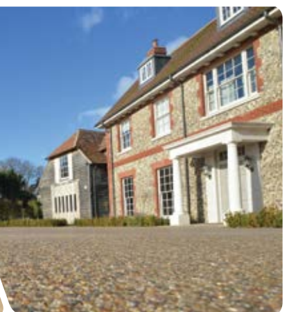
Private driveway, Sussex