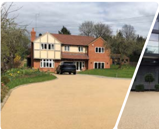
Private Driveway, Henley-on-Thames

Classic Colour Range available October 2020