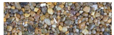
Clearstone: Brewers Malt