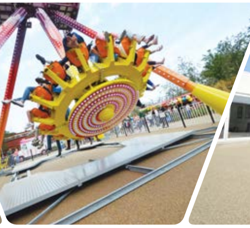
Pendulum ride, Dreamland, Margate