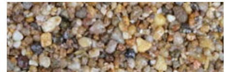
Clearstone: Flaxen Pea