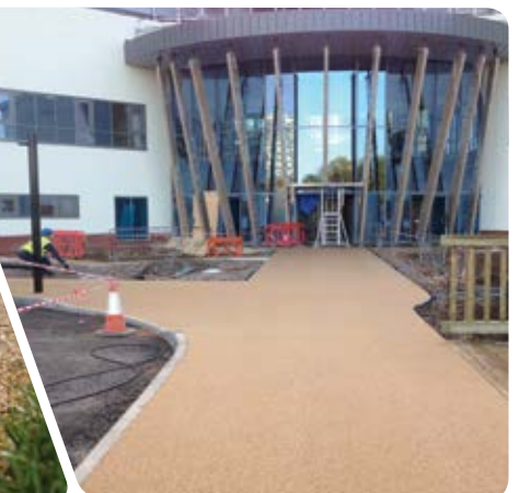
Middlesex Hospital new entrance