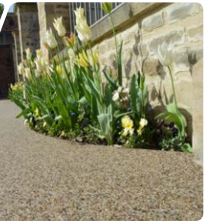
Private Driveway, Oxfordshire