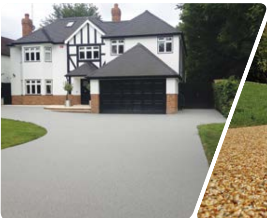
Private Driveway, East Sussex